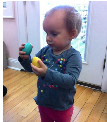
Sing a Song student at Zadie's Nurturing Den

"Just Hatched," is sung to the ever popular tune of "I'm A Little Teapot." For this song, we can use our whole bodies to become the chick ourselves! Watch us break out of our shells!