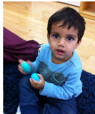
Sing a Song student at Zadie's Nurturing Den

Ta, ta, ta, ta, Is how we say the quarter. Ti, ti, ti, ti, ti, ti, ti, Eighth note is much shorter. Tika, tika, tika, tika, tika, tika, tika, tika, Sixteenth note is so fast! Whole ----- note-----, Four quarter notes have passed. Catch the beat!