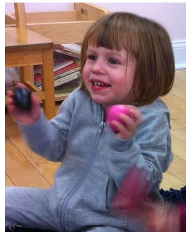
Sing a Song student at Zadie's Nurturing Den

"Just Hatched," is sung to the ever popular tune of "I'm A Little Teapot." For this song, we can use our whole bodies to become the chick ourselves! Watch us break out of our shells!